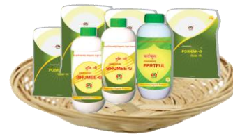
Soil Nourishment Pack

Day 91, 116, 141, 166, 191, 216, 241, 270