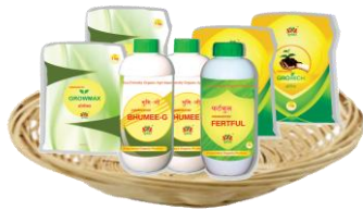
Soil Improvement Pack